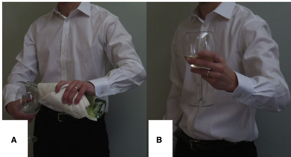
Figure 3 These clinical photographs demonstrate the activities of daily living that replicate the proposed testing positions. (A) Testing at 30° of abduction, 30° of forward elevation, 90° of elbow flexion, and mild internal rotation replicates a “pour” position. (B) Testing at 30° of abduction, 30° of forward elevation, 90° of elbow flexion, and mild external rotation replicates a “toast” position.