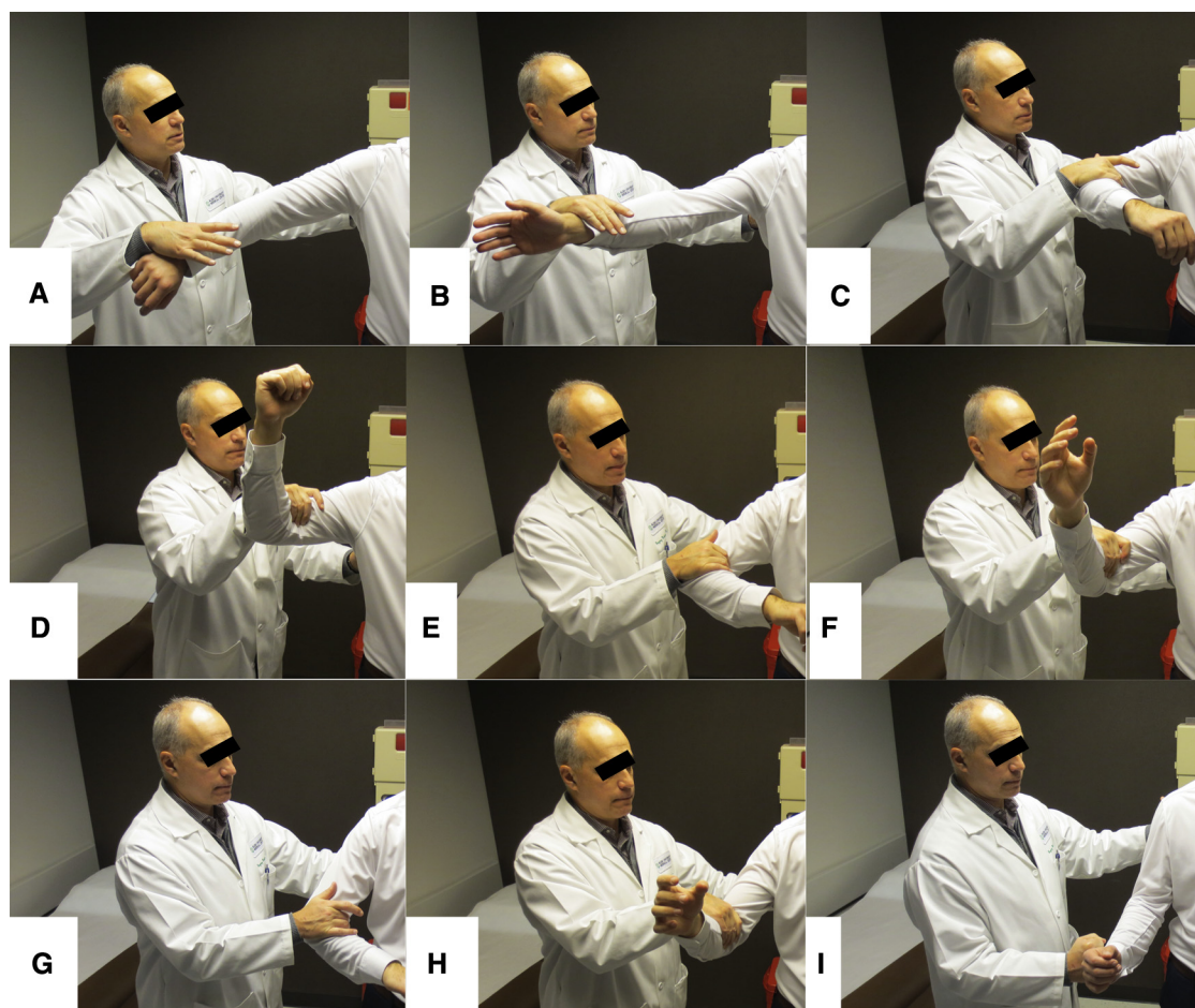
Figure 2 These clinical photographs demonstrate the testing positions. All testing was performed in 30° of flexion, i.e., within the plane of the scapula, and in all cases resisted abduction was tested. Unless otherwise specified, all testing was performed in 90° of elbow flexion. (A) At 90° abduction, full internal rotation, and full elbow extension, Jobe's position or the "empty can" test. (B) At 90° abduction, full external rotation, and full elbow extension, or the "full can" test. (C) At 90° abduction, internal rotation. (D) At 90° abduction, external rotation. (E) At 60° abduction, internal rotation. (F) At 60° abduction, external rotation. (G) At 30° abduction, internal rotation, or the "pour" position. (H) At 30° abduction, external rotation, or the "champagne toast" position. (I) Infraspinatus testing: resisted external rotation with the shoulder in full adduction and neutral rotation.

In those cases in which sphericity was violated, the Greenhouse-Geisser correction of the P value was used. Because 5 separate repeated-measures analysis of variance tests were performed, Bonferroni correction was used, and within these tests, P values of <.01 were considered significant; in all other cases, P values of <.05 were considered significant.