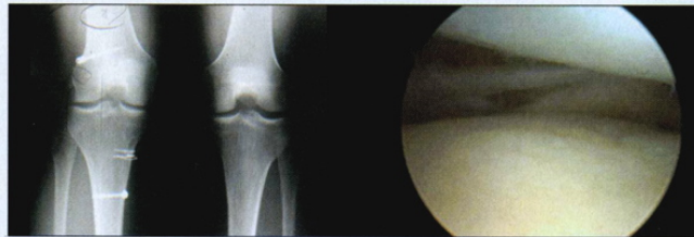
An index arthroscopy of a 23-year-old female volleyball player showed a lateral meniscectomized state with minimal chondral damage.

But when it comes to assessing who is best suited for meniscal transplantation, arthroscopic assessment of the knee remains the gold-standard evaluation tool. It can help rule out patients not suitable for the procedure who were not identified through the physical exam or