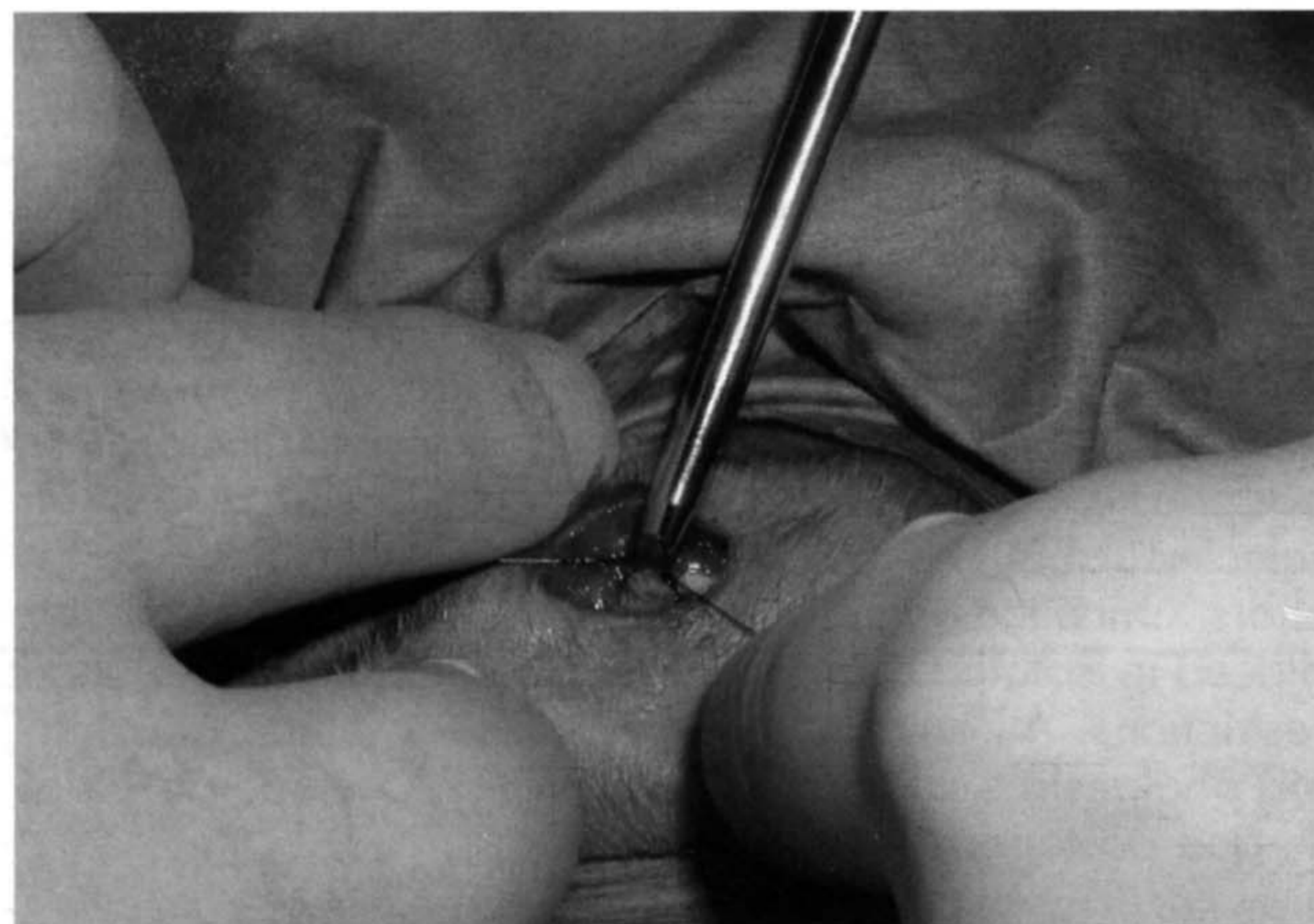
Figure 1 Ultrasonic suture welding with No. 2-0 nylon suture.

Each rabbit was anesthetized with an intramuscular injection of a ketamine and xylazine cocktail (75-100 mg/kg and 10 mg/kg, respectively). The upper extremities