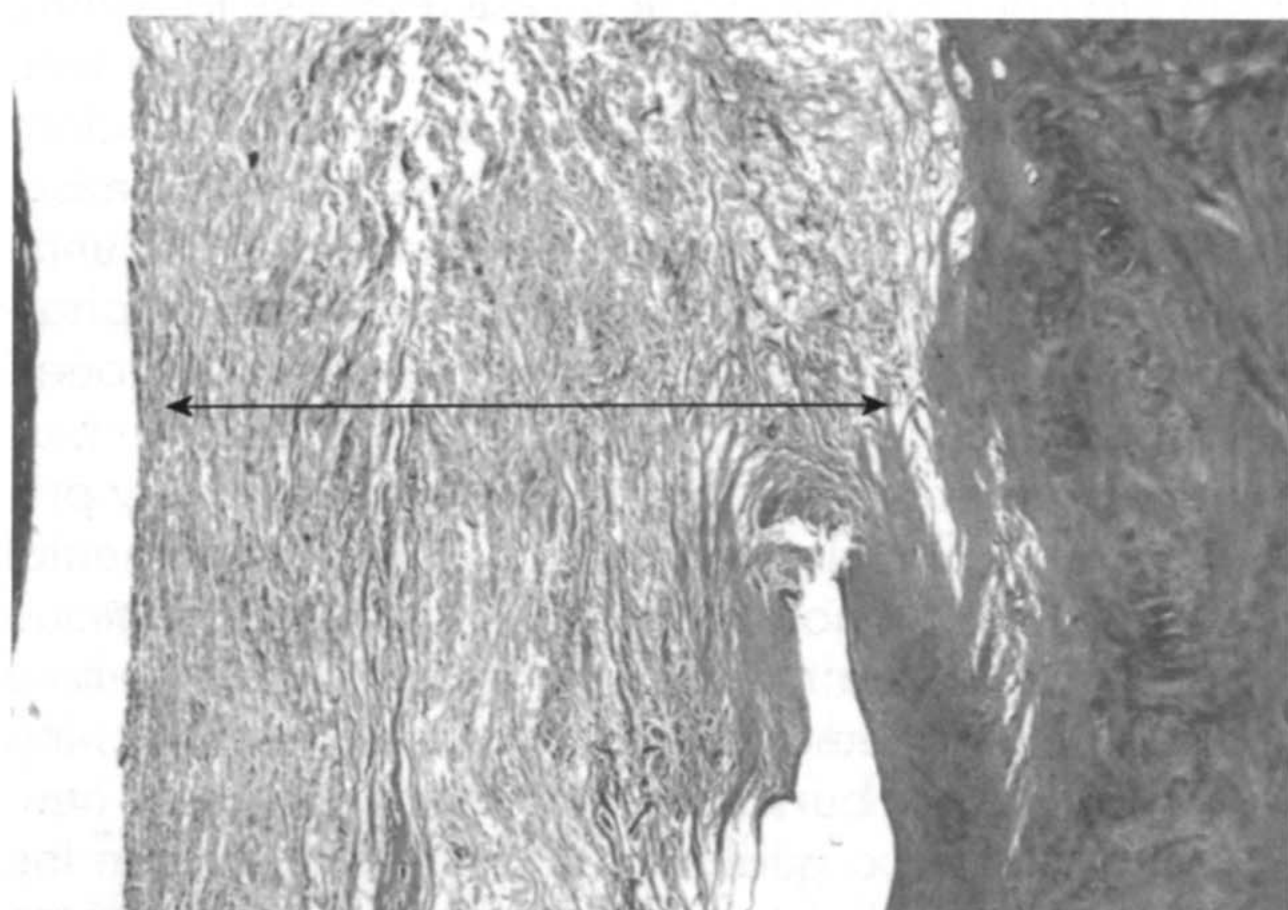
Figure 3 Histologic section (original magnification \times 20 ) of knotted group, with moderately thickened subdeltoid bursa. The arrow demonstrates the extent of subdeltoid bursal thickening.

tunnels. There was no evidence of impaired healing with the suture anchor, and longer-term studies are required to determine whether biomechanical strength continues to improve in the knotted and welded groups.