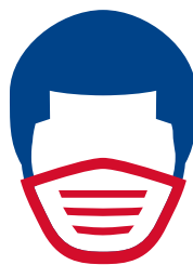
Wear A Cloth Face Covering In Public