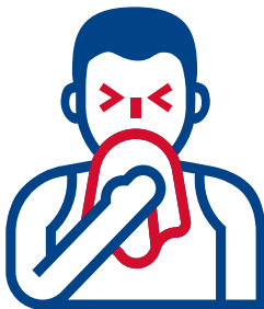
Cover Your Cough Or Sneeze