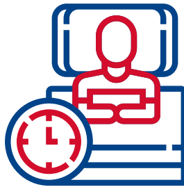
Stay At Home If You Are Sick