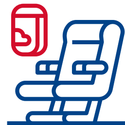
Seek Out A Window Seat